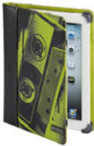
iPad and iPad Case by Maroo