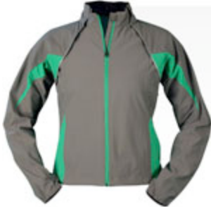
Scottevest Travel Wear

Vests are cool again, especially for traveling, thanks to Scottevest. The designer makes a full line of clothes for men and women, from vests to coats, which feature specialized pockets and compartments to hold all your electronic gear.